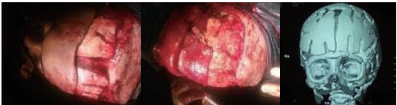
Fig. 3. 3D computed tomography showing effective reconstruction by craniotomy.

In terms of surgical procedures, five cases (27.8%) underwent endoscopic technique (ET), 10 cases (55.6%) underwent craniofacial reconstruction, and three cases (16.6%) underwent open burring of the metopic ridge. So the open technique (OT) was 13 patients (72.2%). Estimated blood loss was 55 mL in ET and 150 mL in OT. Operative time was 1.6 hours in ET and 2.8 hours in OT.